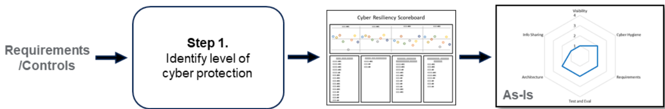
Figure 3. CRL ® – Step 1

Requirements and/or controls are correlated to a category and evaluated against category criteria and performance measures. A CRL ® measurement is provided for each individual category. The resulting measurement of categories is expressed using a radar chart (see Figure 3). Results from this step give stakeholders improved insight into the level of cyber resiliency that currently exists and/or is planned.