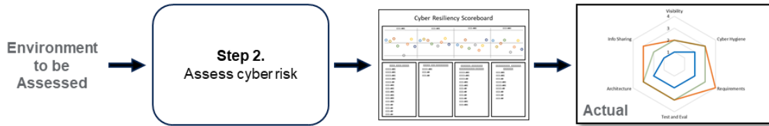
Figure 7. CRL® – Repeat Step 2

After controls are integrated into the operational environment, stakeholders can decide to do another measurement (see Figure 7) to validate the effectiveness of controls and leverage the radar chart, for the third time, to display the actual level of protection.