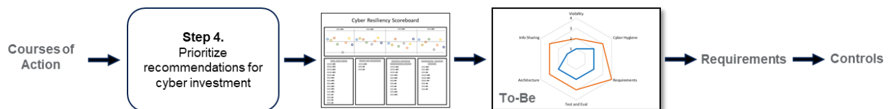
Figure 6. CRL® – Step 4

In Step 4, the program team collaborates with stakeholders to prioritize and select CoAs. The team compares selected CoAs to the criteria delineated in the CRS® to identify category levels. Results are presented to stakeholders via a radar chart (see Figure 6) to provide visualization comparison between as-is results and to-be recommendations.