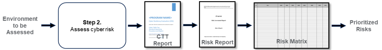
Figure 4. CRL® – Step 2

Step 3: Identify relationships between cyber investments and amount of increased resilience to attack.