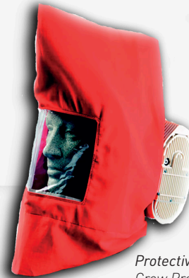
Protective Breathing Equipment Crew Protection from Hypoxia, Smoke & Toxic Fumes